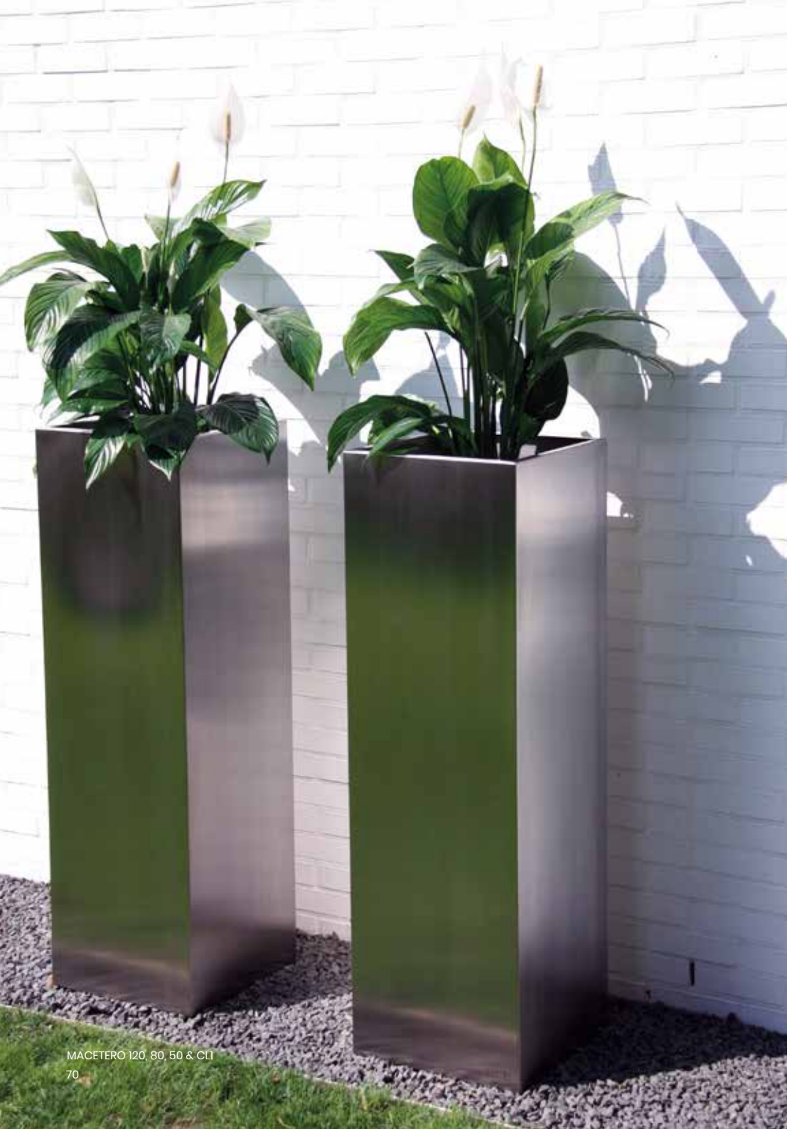
MACETERO 120, 80, 50 & CL1